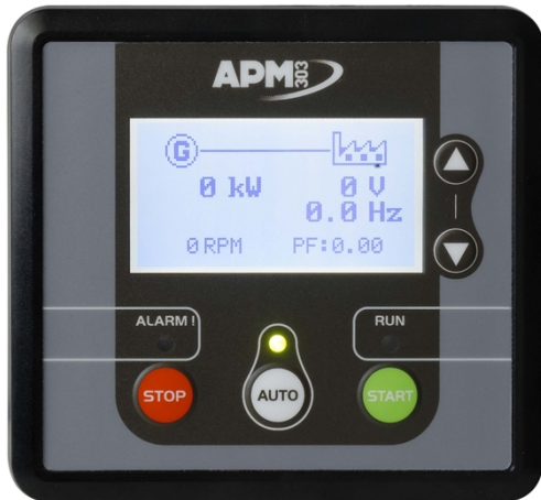
APM303, comprehensive and simple

The APM303 is a versatile unit which can be operated in manual or automatic mode. It offers the following features: Measurements: phase-to-neutral and phase-to-phase voltages, fuel level (In option : active power currents, effective power, power factors, Kw/h energy meter, oil pressure and coolant temperature levels) Supervision: Modbus RTU communication on RS485 Reports: (In option : 2 configurable reports) Safety features: Overspeed, oil pressure, coolant temperatures, minimum and maximum voltage, minimum and maximum frequency (Maximum active power P<66kVA) Traceability: Stack of 12 stored events For further information, please refer to the data sheet for the APM303.