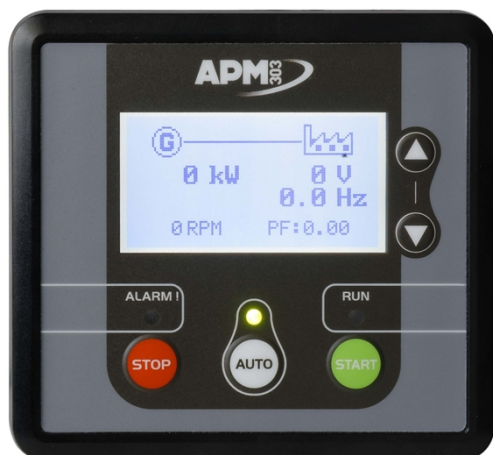
APM303, comprehensive and simple

The APM303 is a versatile unit which can be operated in manual or automatic mode. It offers the following features: Measurements: phase-to-neutral and phase-to-phase voltages, fuel level (In option : active power currents, effective power, power factors, Kw/h energy meter, oil pressure and coolant temperature levels) Supervision: Modbus RTU communication on RS485 Reports: (In option : 2 configurable reports) Safety features: Overspeed, oil pressure, coolant temperatures, minimum and maximum voltage, minimum and maximum frequency (Maximum active power P<66kVA) Traceability: Stack of 12 stored events For further information, please refer to the data sheet for the APM303.