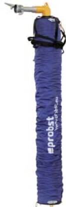
HE-35 – HE-250